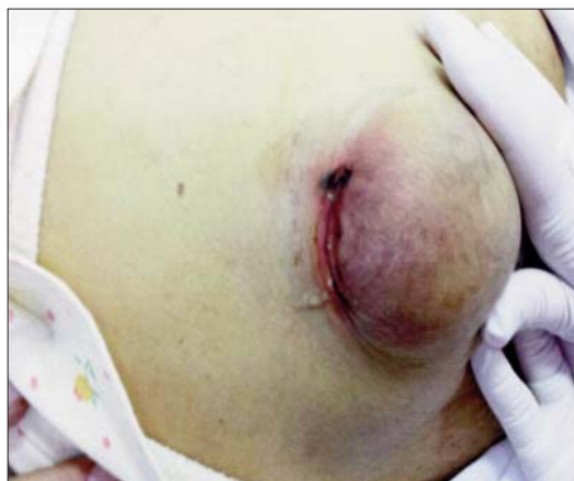
Figure 4. Umbilical hernia in a patient with cirrhosis and ascites