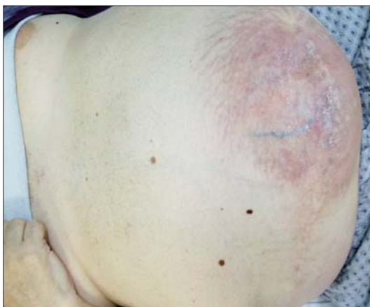
Figure 3. Incisional hernia in a patient with liver cirrhosis and ascites

The presence of ascites is most commonly associated with the presence of umbilical hernia in the cirrhotic patient. Increased abdominal pressure secondary to ascites directly leads to the appearance of the hernia, along with the weakening of the fascial and muscular structures, amid nutritional deficiencies. If the prevalence of the umbilical hernia is 2% in the general population, in the context of cirrhosis it increases to 20% or even 40% in the presence of ascites. For other types of parietal hernia, the presence of ascites per