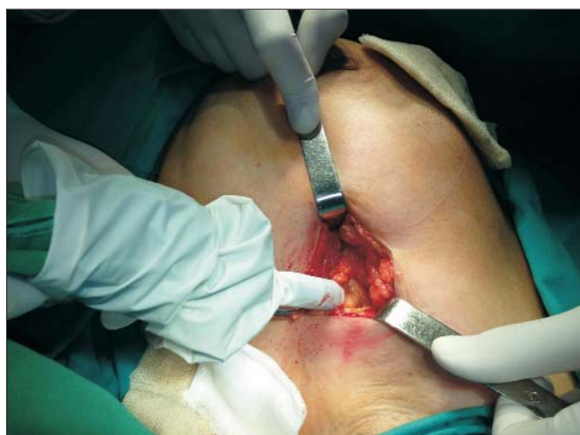
Figure 3. SLN intraoperative detection using gamma-probe

In case of non-axillary localization of the SLNs diagnosed with micro- or macrometastases, their excision was followed by modification of the classic therapeutic attitude, by performing radiotherapy that includes in the target volume the site of the non-axillary lymph node and, depending on the tumour grading, by adding adjuvant chemotherapy.