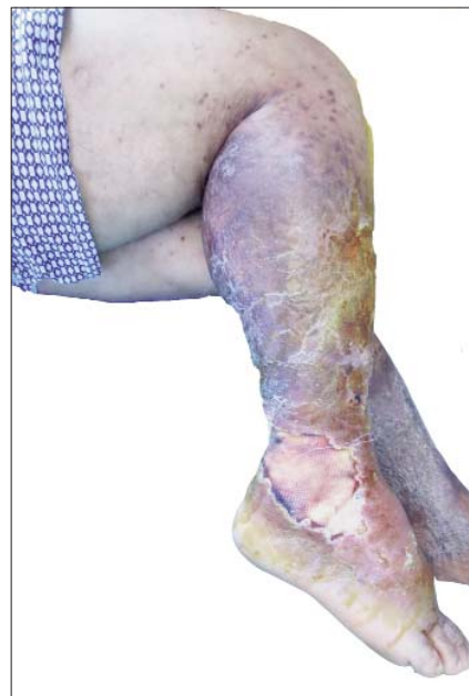
Figure 1. Lesional aspect after 10 days of treatment (lateral right view)

History of the patient revealed: morbid obesity, neglected