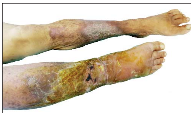
Figure 2. Lesional aspect after 10 days of treatment (frontal view)