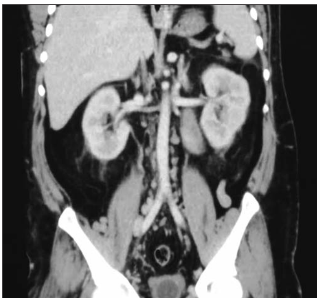
Figure 5. CT scan – coronal plane