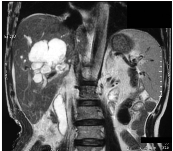
Figure 2. MRI appearance of the mass

with jaundice secondary to obstruction or compression of the biliary system (4,5).